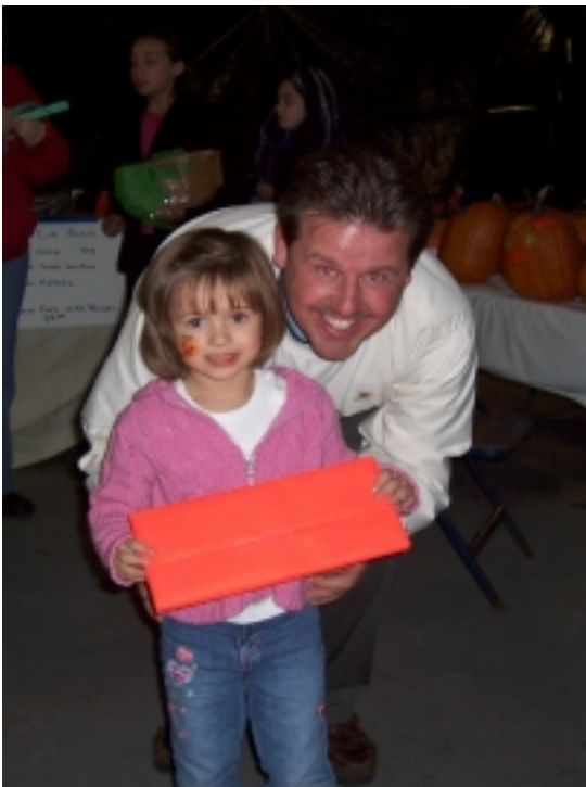
*Pig Roast 2005