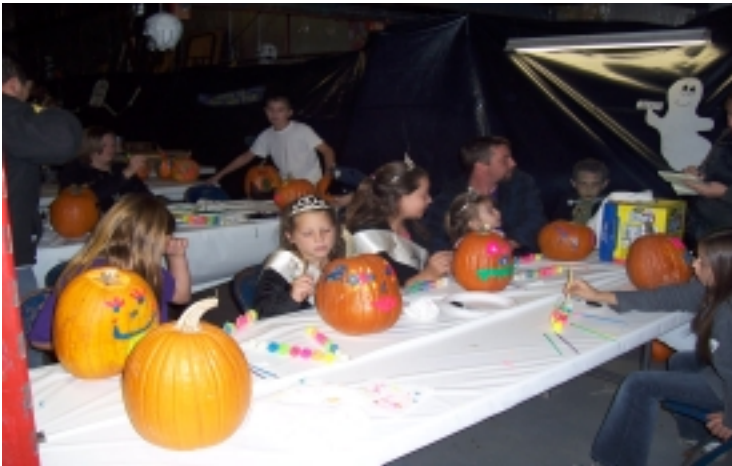
*Pig Roast 2005

Please help us raise money for Dollars for Scholars and put your aluminum cans out on Monday mornings and the Village will pick them up. This program awards yearly scholarships to our residents. If you have any questions please contact me at 847-546-1206.